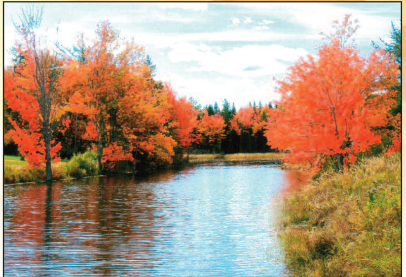
Right: Fall colours taken at Little Black River Bridge.