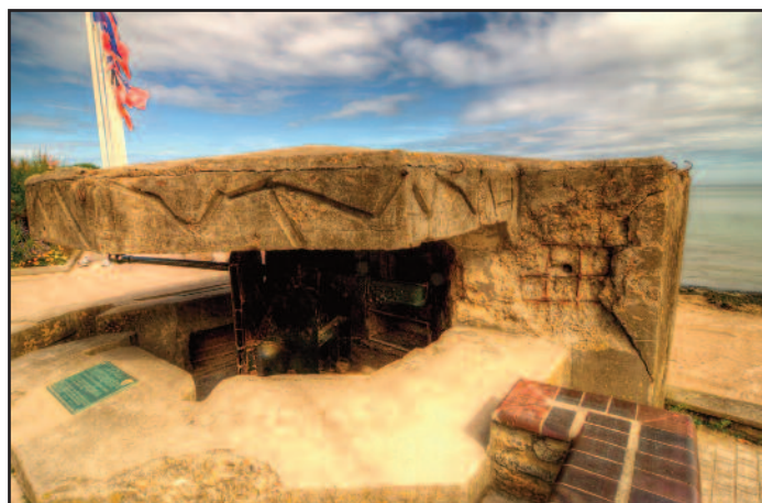
A German Antitank Gun overlooks the beach at Saint-Aubin-sur-Mer, Normandy, with its 50mm Canon still intact.

THANK YOU , lads and ladies, and my heartfelt condolences to the families who lost their loved ones for our freedom and betterment of life.