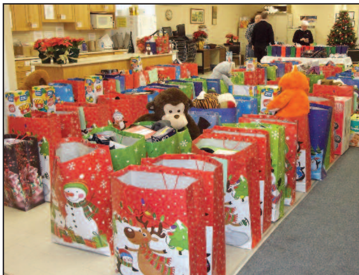
Staff are filling gift bags with donated and purchased toys.

At MCG Media, we are one of 23 businesses, organizations and individuals who directly sponsored food and/or gifts for a family last year. Our staff each donates money to the pot, in lieu of buying office gifts for each other, and we go out and buy gifts specific to a certain age boy or girl. This year instead of buying groceries we only need to purchase a grocery gift card. This way the family gets to choose what they like and it allows them to stretch out the purchases instead of receiving all the food at once.