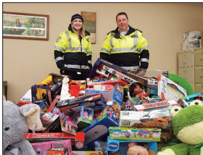
Ambulance NB held a toy drive at Walmart last year and donated 218 toys as well as Walmart gift cards.

Last year there were 210 families registered for the Christmas Hampers which included 156 children & teens and 291 adults, and they all received food and/or gifts. This was made possible through funds raised in the Kettle Campaign, and numerous donations of food, toys, turkeys, toiletries, gift cards and money from individuals, businesses, service groups, churches, schools and organizations in the community. There are also people who knit hats, mittens and scarves all year long to donate.