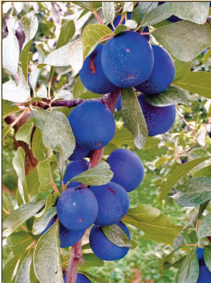
Plum trees lush with fruit at McAllister Farm.