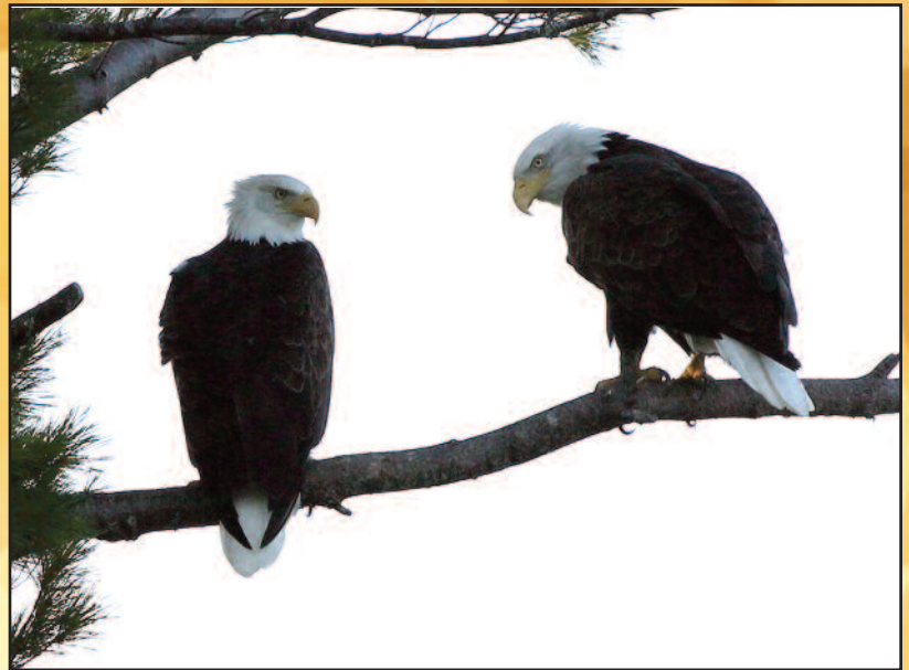
Bald Eagles at Beaubears Island, taken with a 400 mm lens from the deck of the Max Aitken.

A Common Tern with a freshly caught Sand Lance returns to Portage Island to feed his young. This summer, the southern tip of Portage Island in Miramichi Bay was home to hundreds of Common Terns who use the protected island as a nesting ground. This area, also known as "The Entrance" to Miramichi Bay, is a very productive feeding spot for birds and fish, with Sand Lance being one of the common forage species.