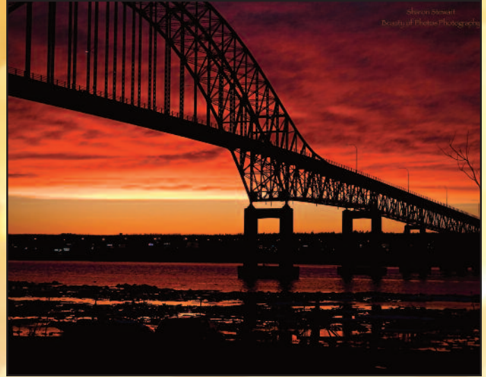
Miramichi Centennial Bridge at sunset